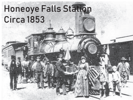
Honeoye Falls Station Circa 1853